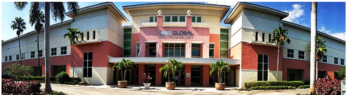
KRS Global Technology headquarters in Boca Raton

The County’s $160,000 economic development incentive to KRS Global is leveraged by $1.3 million in State incentives from the Quick Action Closing Fund and the Qualified Target Industry tax refund program. KRS Global will invest a minimum of $28 million for capital projects and create 160 new full time jobs with an annualized average wage of $63,356.