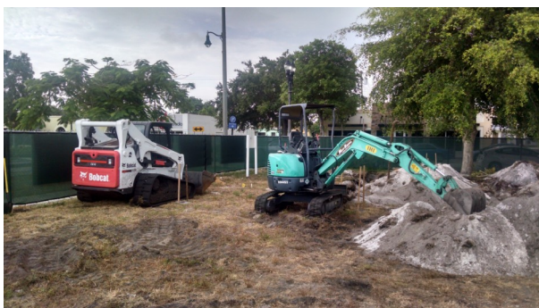
Digging air sparge and soil vapor extraction wells at the Northwood Anchor site.

New Brownfields Project in West Palm Beach: DES will partner with the City of West Palm Beach to implement a $200,000 clean-up project on the 1400 block of Henrietta Avenue in the City's Coleman Park neighborhood. The 1.5 acre site sits adjacent to properties which previously housed a lumber yard, petroleum station, refineries, auto repair shops, and a dry cleaning business. The clean-up project will facilitate redevelopment of the site into an urban garden, operated by Urban Growers Community Economic Development Corporation. The garden is expected to serve as a community food hub, providing access to fresh produce for the 1,700 residents who live in the Coleman Park neighborhood.