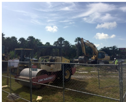
Remediation at South Bay site

Clean-Up Begins in South Bay and West Palm Beach: With support from the County's Brownfields Revolving Loan program, brownfield sites in South Bay and West Palm Beach have started the clean-up process. The South Bay Site, located at 480 US Highway 27 North, will be developed into a restaurant. The clean-up and redevelopment process is expected to create 20 jobs and have a five year economic impact of $3.12 million. Once the restaurant is opened, it is expected to create six new jobs in South Bay. A loan to the West Palm Beach Community Redevelopment Agency is supporting clean-up and redevelopment within the Northwood Community Redevelopment area. The Northwood "anchor" site is nearly three acres of land on the western boundary of Northwood Village. Clean-up began with a community kick-off meeting attended by DES staff, West Palm Beach CRA staff, and representatives from Terracon, the project's environmental consultant. The West Palm Beach CRA is actively working to promote the redevelopment and sale of the site and estimates the project will create 75 to 100 new jobs with annual salaries totaling $3.5 million.