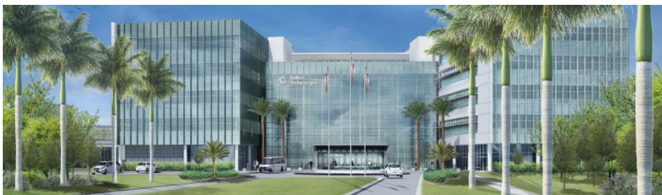
Artist's rendering of the UTC Center for Intelligent Buildings in Palm Beach Gardens.

Hilton West Palm Beach Opens: The stylish new hotel is one of the most significant public-private partnerships in Palm Beach County and is key to the long-term success of the Convention Center.