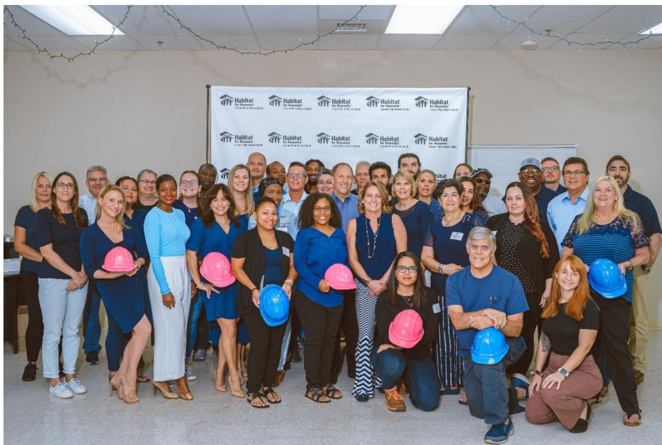
Habitat for Humanity greater Palm Beach County.

Habitat for Humanity Greater Palm Beach County is a 501(c)(3) organization and an affiliate of a global nonprofit, Habitat for Humanity International serving Palm Beach County. Families and individuals in need of a safe, decent, and affordable housing partner with Habitat for Humanity to build or improve a place they can call home. Habitat homeowners help build their own homes alongside volunteers and pay an affordable mortgage. Through financial support, volunteering or adding a voice to support affordable housing, everyone can help families achieve the strength, stability and self-reliance they need to build better lives for themselves. Through shelter, we empower. To learn more, visit habitatgreaterpbc.org