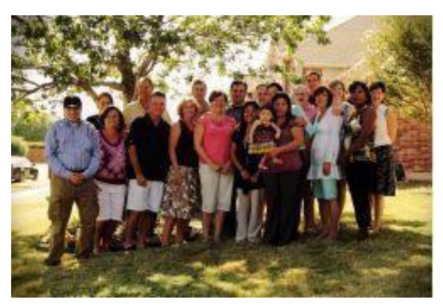
Family Portrait: A graduated Sister in Dallas, TX and her Table.

Each Table is hosted by a congregation (up to three congregations may share a Table). A required team of volunteers (10-12 people help an adult or family and 6-7 help a young adult transitioning out of foster care or a veteran) serve over an 8 – 12 month period. Tables generally meet once a week and often at a lesser intensity as the work progresses. Table members are primarily generalists, work as teams and also provide leadership for important life domains (see Open Table model diagram). A national team of volunteer Open Table Coaches train a volunteer Congregation Coordinator in each faith community to lead the model and launch Tables.