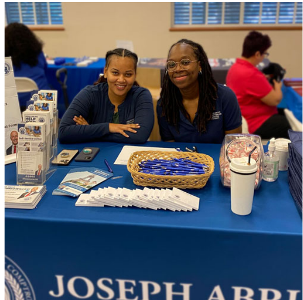
Project Homeless Connect Saturday, January 19 Boynton Beach

Check out photos of events, superstar employees and more on our