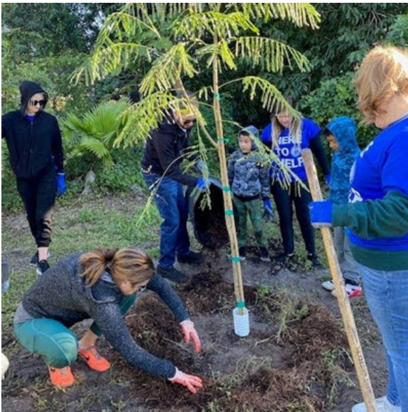
Community Greening Saturday, January 14 Delray Beach

We're here to help - and not just at the courthouse!