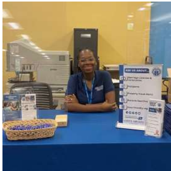
Library Office Hours West Palm Beach, Boynton Beach, Jupiter