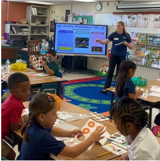
Junior Achievement for a Day West Palm Beach