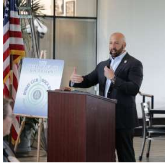
Rotary Club Boca Raton