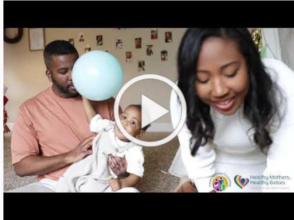
Healthy Babies, Healthy Children, Healthy Life: A Symposium