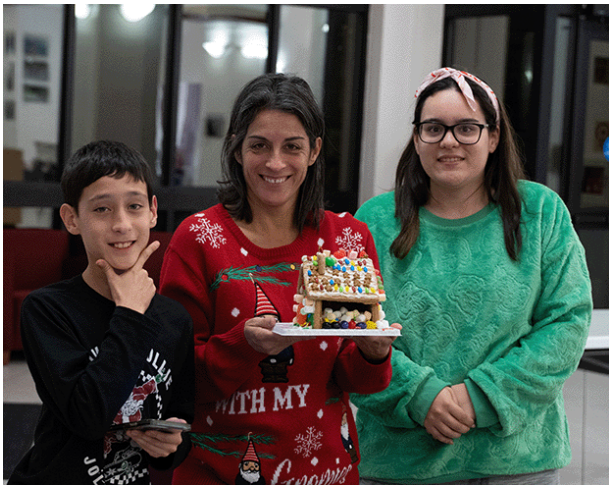
2022 Gingerbread Land Winners