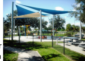
Westgate splash playground and park