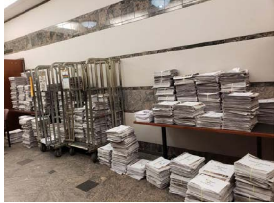
The Voters Guides