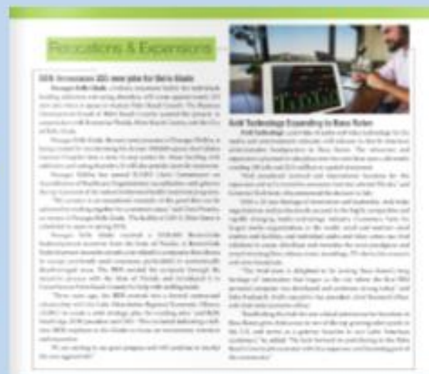
Quarterly Palm Beach County Business Magazine Fall 2015