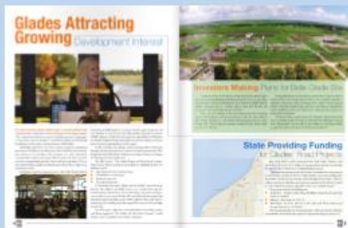
Quarterly Palm Beach County Business Magazine Winter 2015