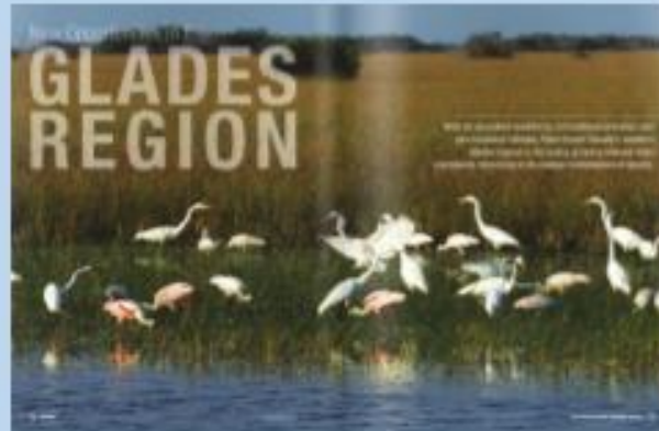
Annual Profile Magazine 2015