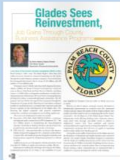
Quarterly Palm Beach County Business Magazine Fall 2014