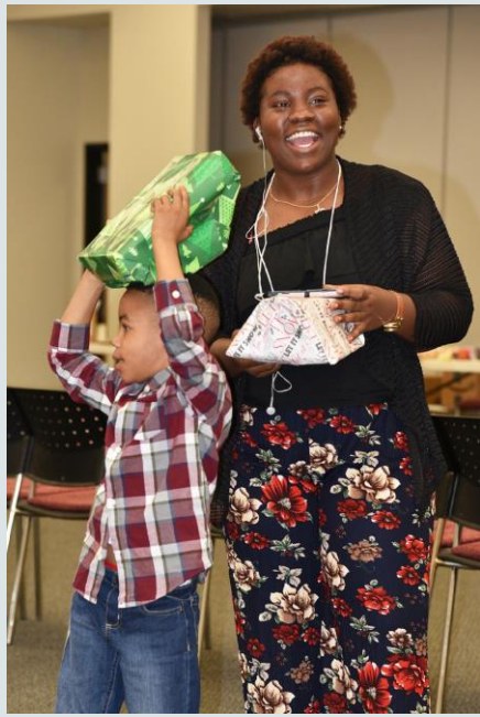
Picture to the right: gift items ready for School District's Teen Parent holiday event.