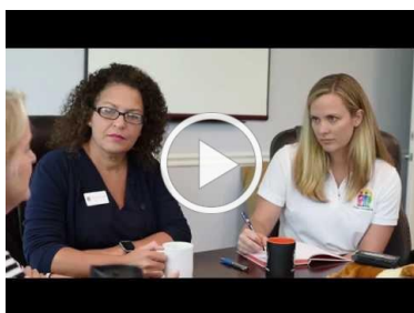
Fighting Adverse Childhood Experiences in Palm Beach County

Listen to Leaders Talk about the Impact of ACEs (2016):