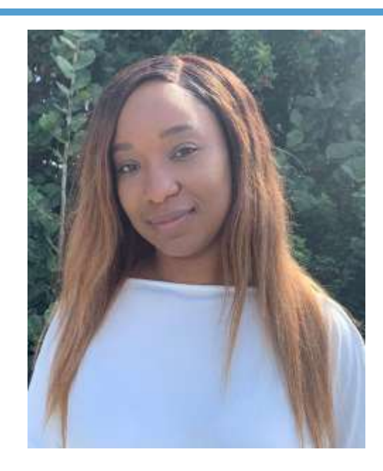
Kaley also enjoys creating activities to help boost staff moral.