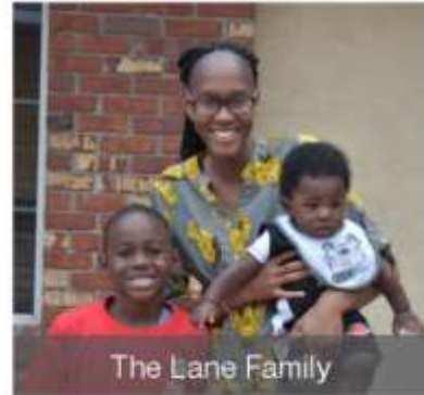
The Lane Family